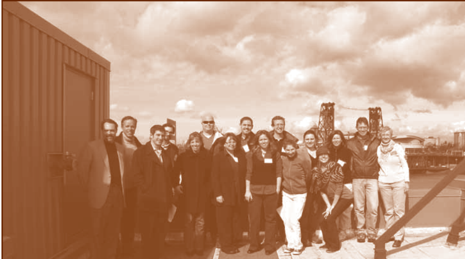
Green Building workshop participants on the roof of the White Stag Block during a tour of the building.