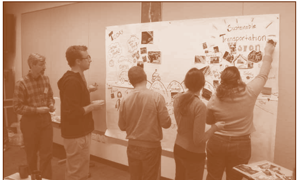
Participants engage in the sustainable transportation planning exercise during the Transportation Strategies for Sustainable Communities workshop.

One way to reduce risk and improve the environmental performance of organizations is to harness the power of purchasing. Through individual and team exercises, discussions, and presentations from experienced buyers of sustainable products, this workshop will help participants to understand the key concepts of using purchasing effectively.